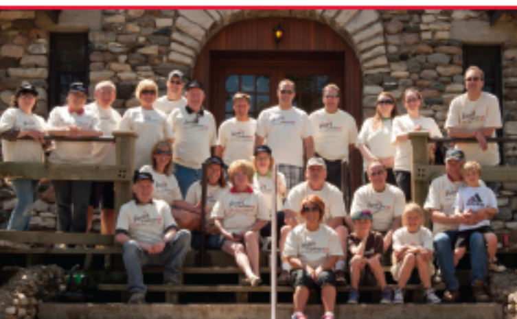
Safeway employees spend a day in May beautifying Camp.