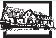
Camp Easter Seal

Camp Easter Seal is a wheelchair-accessible resort for people with disabilities. Camp Easter Seal offers all of the usual activities such as horseback riding and swimming but with on staff medical professionals we are able to offer special camping sessions for people with higher care needs.